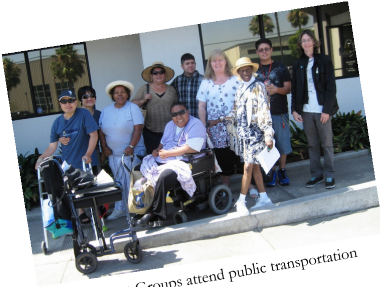
DRC Support Groups attend public transportation training to Seal Beach outing