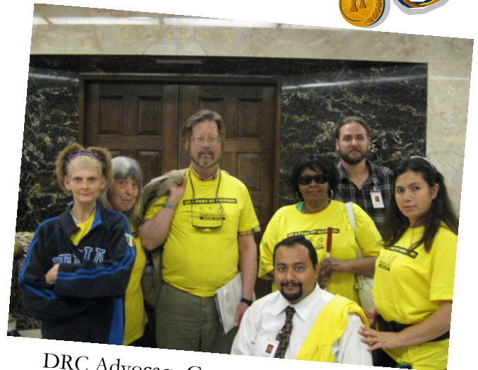
DRC Advocacy Group at the Governor's Office in Sacramento